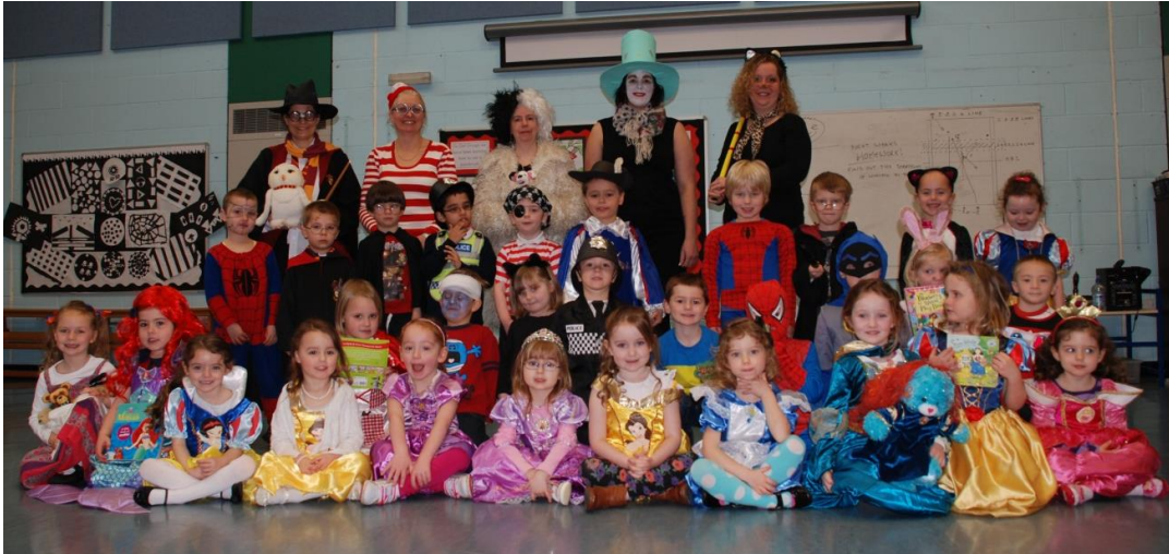
The children and teachers looked great.

Thank you children and parents for sourcing or making outfits of favourite book characters.